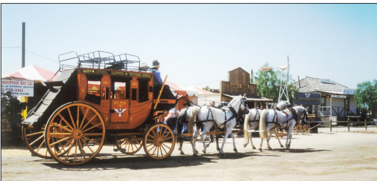
Stage Coach at End of Trail